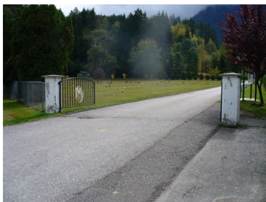
Mountainview (Municipal) Cemetery Entrance