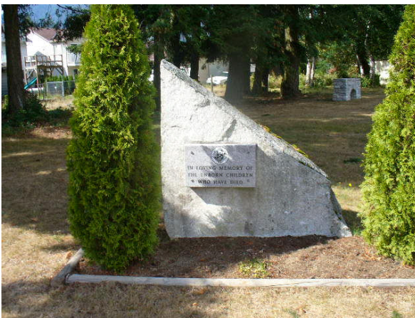
Monument to unborn children and alter