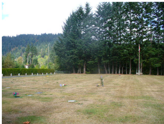
Royal Canadian Legion Cemetery