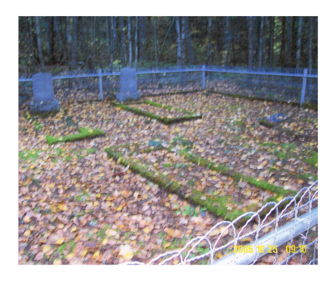
Yale Chinese (On Lee) Cemetery 5 graves occupied