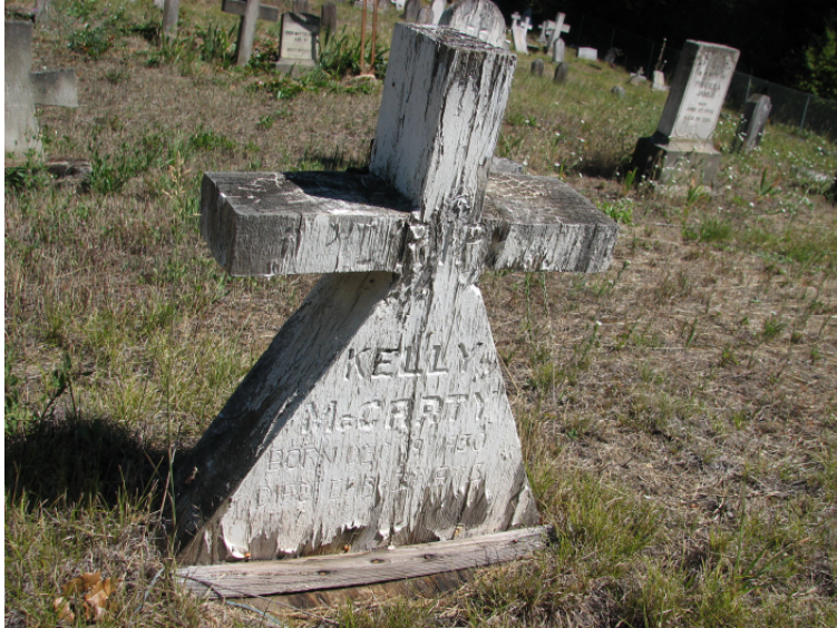
This is an example of the grave markers found at Boston Bar.