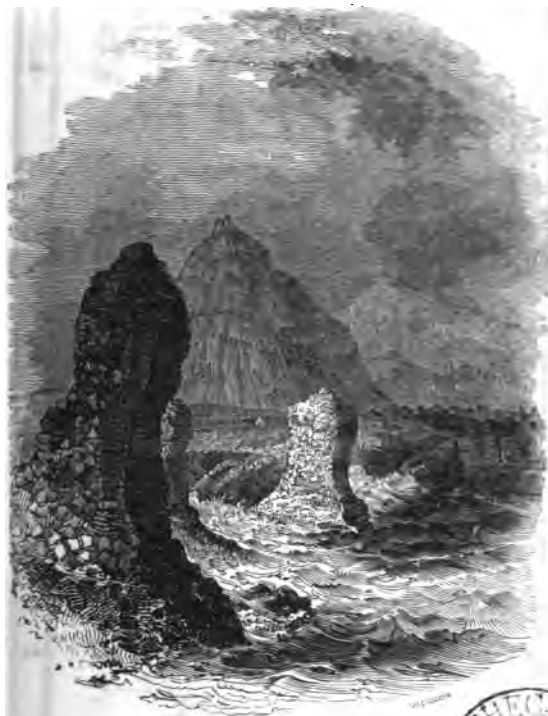
VIEW OF THE COAST NEAR STAFFEN.